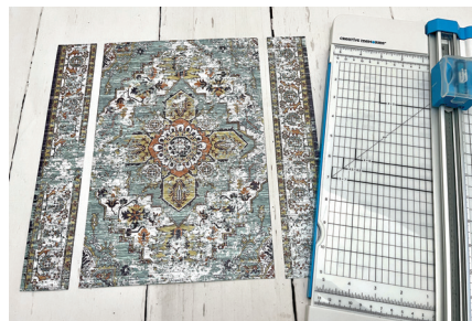
2. Cut papers with 12-inch Trimmer.