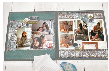
6. Adhere embellishments with Tape Runner and Foam Squares.