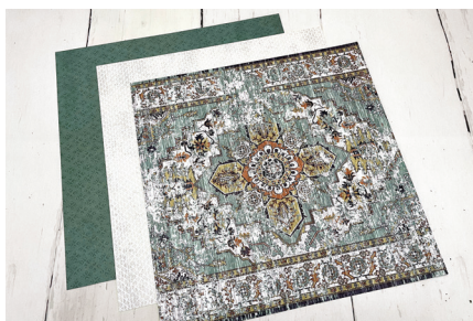
1. Select papers.