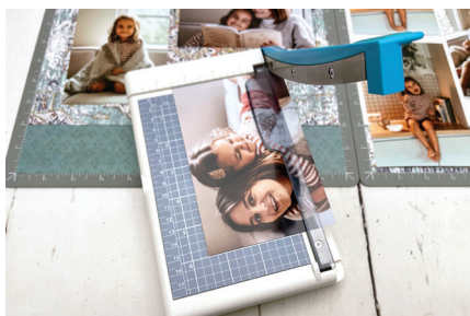
4. Crop photos with Personal Trimmer.