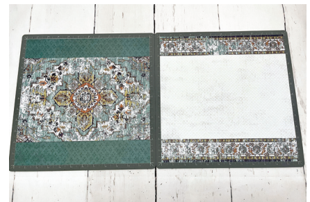
3. Arrange paper pieces on base pages.