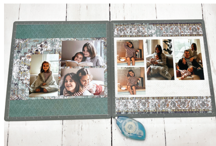
5. Adhere photos with Tape Runner.