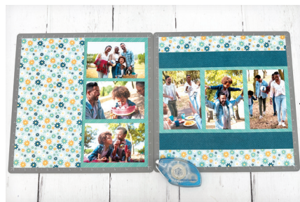
5. Adhere photos with a Tape Runner.