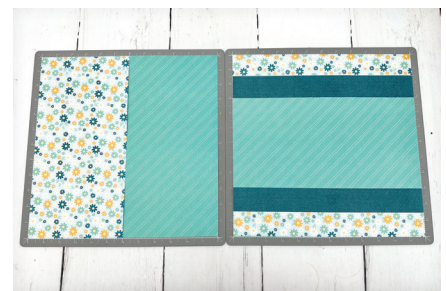
3. Arrange paper pieces on base pages.