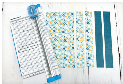
2. Cut papers with the 12-inch Trimmer.