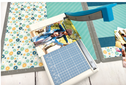
4. Crop photos with the Personal Trimmer.