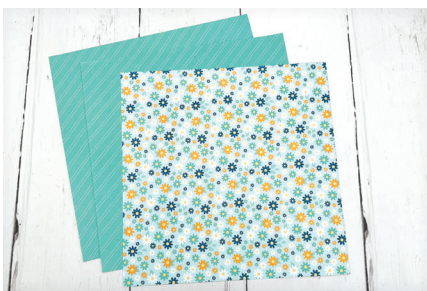
1. Select papers.