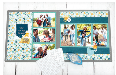
6. Adhere embellishments with a Tape Runner and Foam Squares.